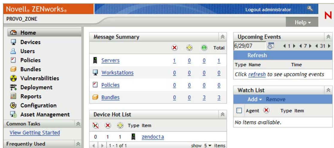
Figure 1-2 ZENworks Control Center

ZCC is installed on all Primary Servers in the Management Zone. You can perform all management tasks on any Primary Server. Because it is a Web-based management console, ZCC can run from any supported workstation .